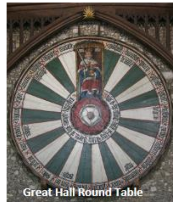
Great Hall Round Table