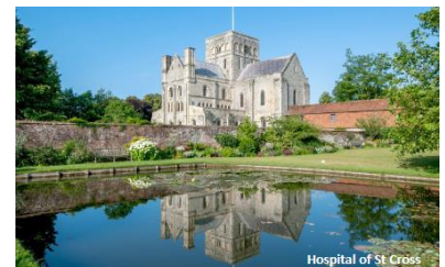
Hospital of St Cross